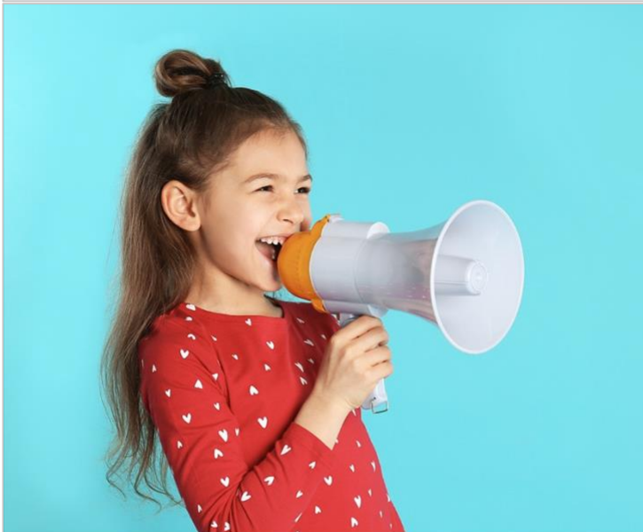
exclamar (ehks-klah-mahr) ENGLISH: EXCLAIMED