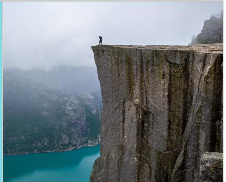
acantilado (ah-kahn-tee-lah-doh) ENGLISH: CLIFF