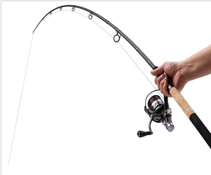
sedal (seh-dahl) ENGLISH: LINE