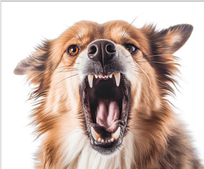
gruñido (grou-nyee-doh) ENGLISH: SNARL