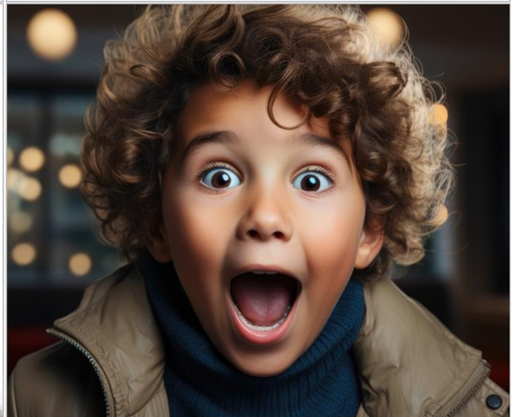
jadear (hah-deh-ahr) ENGLISH: GASP