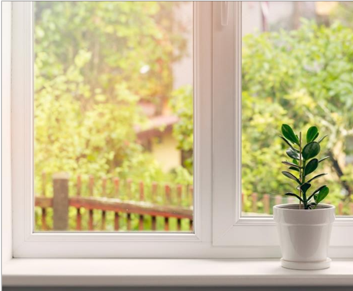
alféizar (ahl-fey-sahr) ENGLISH: WINDOWSILL