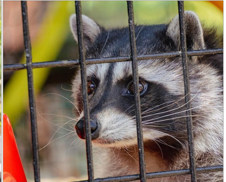
atrapado (a-tra-pa-do) ENGLISH: TRAPPED