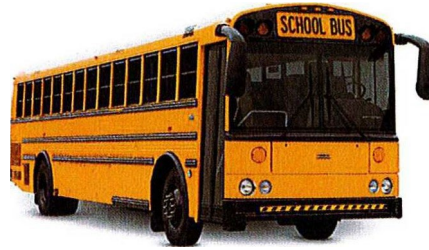
Rear Engine Style