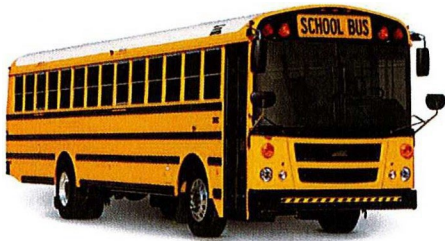
Front Engine Style