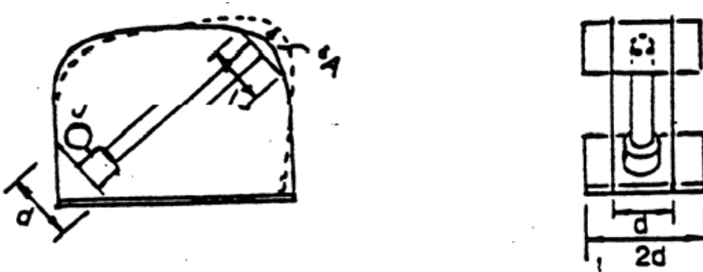
Transverse Cross Section

When a complete bus body is rack-loaded, the total load DVW must be distributed uniformly along the length of the bus body. This may be accomplished by mounting a series of hydraulic jacks along the length of the bus interior. Seats may be removed to facilitate jack mounting. The rack load will be considered to be uniformly distributed when the variation in the hydraulic jack readings is less than 10 percent. A maximum load is the sum of all jack readings and shall equal DVW.