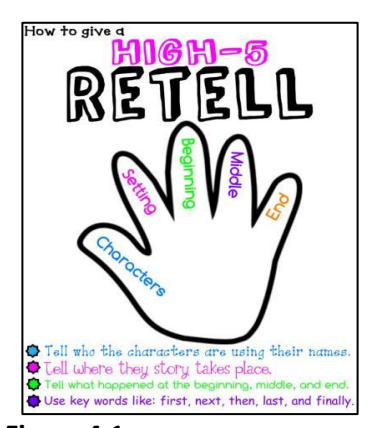
Figure 4.1 Activity 3: Whole Group – Storytime

T: The other day I showed you how to retell a story using your hand. Today we're going to make a chart to help us remember all the parts of that we need to retell. (Draw the chart shown in Figure 4.1 as you review the strategy.) We use our thumb to help us remember to tell about the characters. We use our pointer finger to remember to tell the setting. We use our third finger to tell the beginning of the story. The beginning of the story tells us the characters, the setting, and what happens first. Next, we use our ring finger to tell the middle of the story. The middle of the story is when the problem happens. Finally, we use our pinkie to tell the end of the story. The end of the story tells us how the problem got solved. Today, listen carefully as I read the story, The Perfect Dog. When I finish, we're going to retell the story using this strategy.