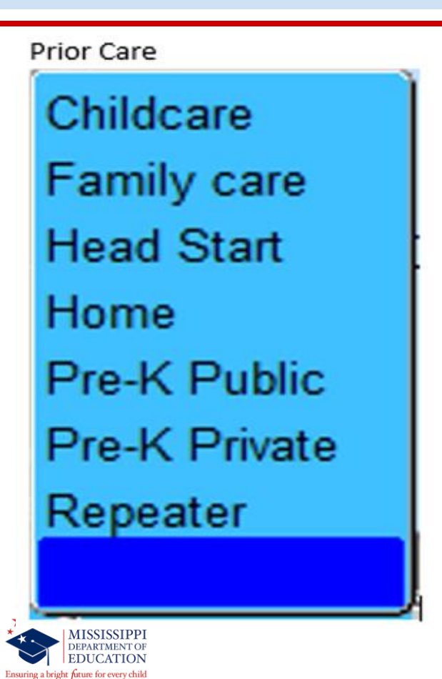
Figure 1: File Layout